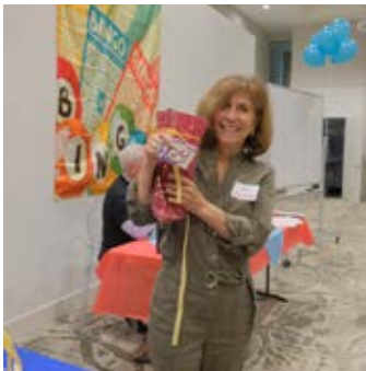
Bingocolada was a fun night for all!

The Knit & Nosh group is gearing up to resume monthly knitting get-togethers. If you knit and you can help, please contact Amy LaGala at 561-445-1121. If you don't knit, you can help by designating "Healing Blankets" when you make tribute donations to Sisterhood at tbebo.ca.org/sisterhood